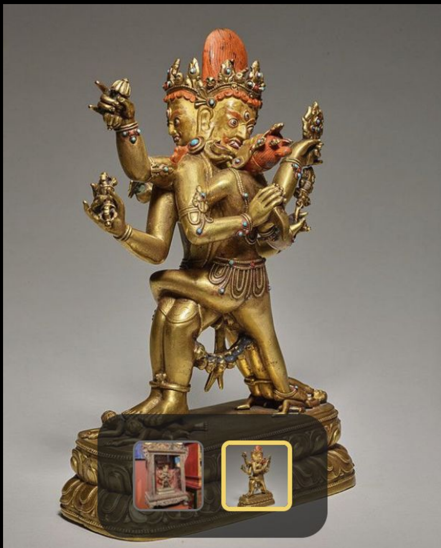
Union of wisdom (female energy) and compassion (male energy)