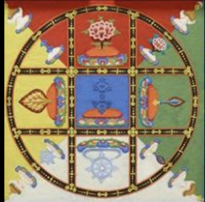
Monks of the Gyuto Tantric University, Yamantaka Mandala, 1991 Colored silicate and adhesive on wood 92.44