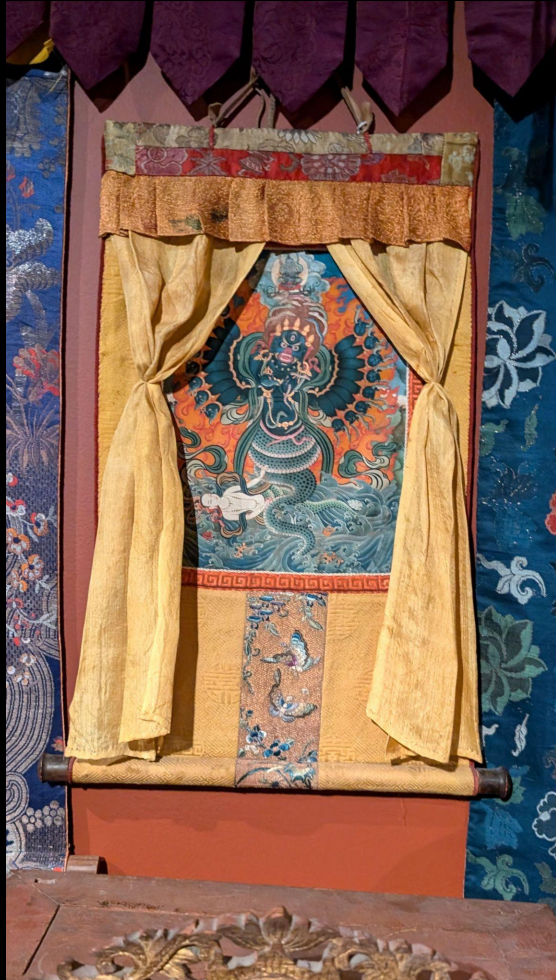
Minneapolis Institute of Art