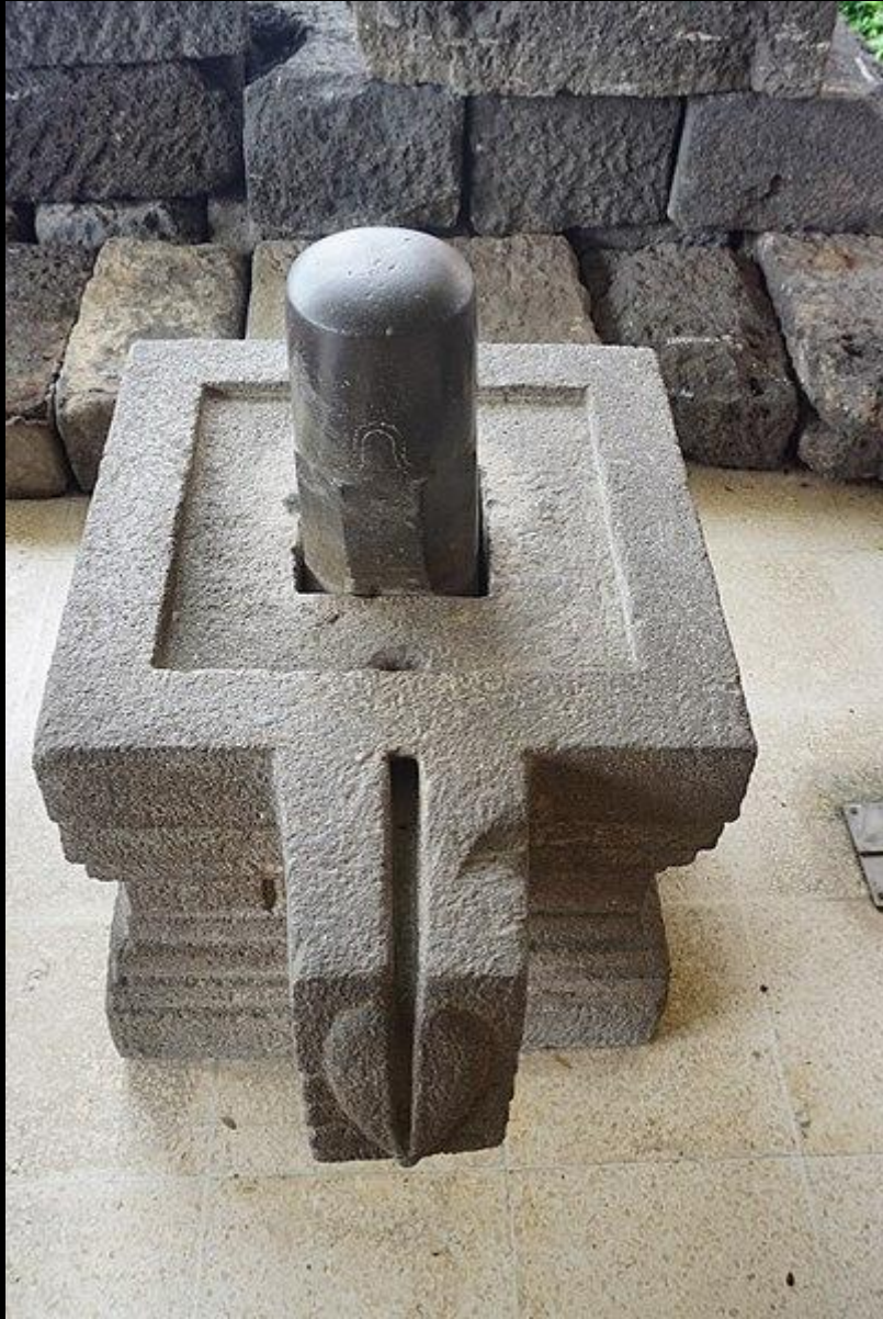
Linga-yoni, East Java, Indonesia