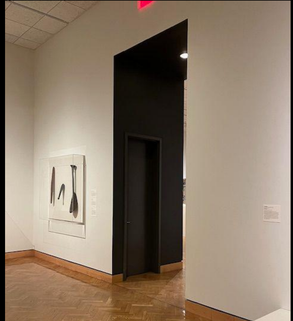
Minneapolis Institute of Art