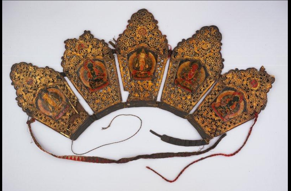
Tibet or China, Ritual crown (diadem), 18th century Leather with polychrome lacquer 98.52 Gallery 212