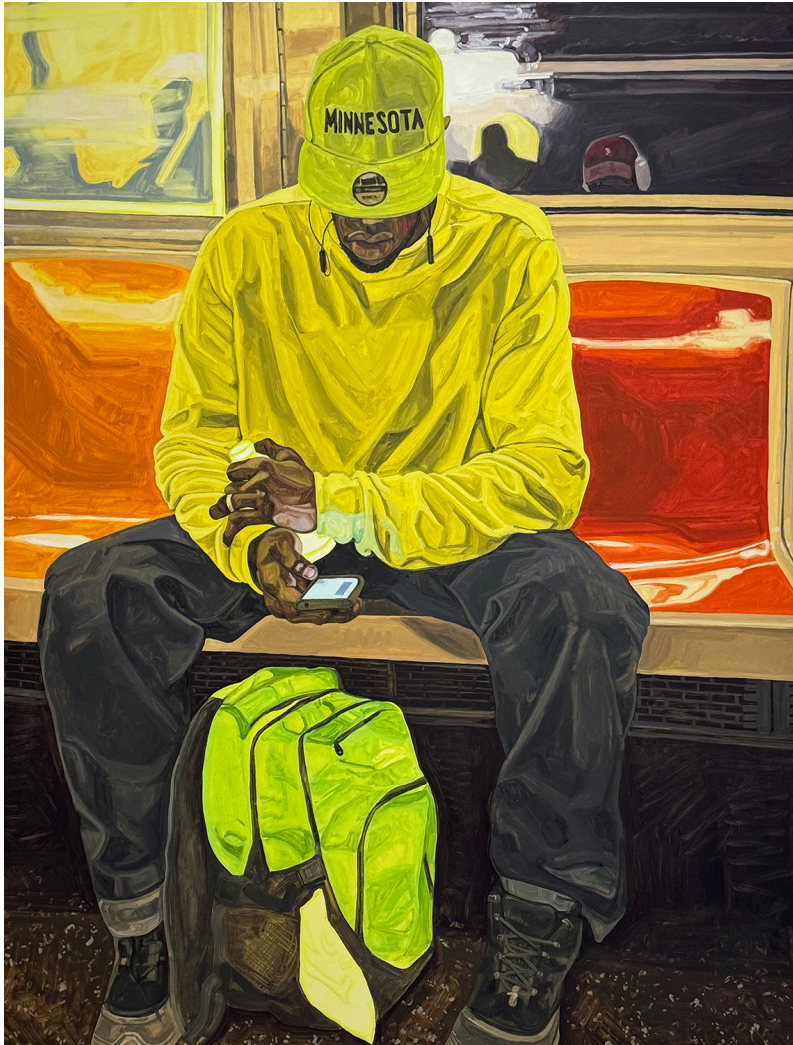
Minnesota, 2020 • Jordan Casteel